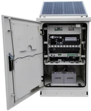
ABB central inverters PVS800 - 500 to 1000

Storage, ESL-C, DC1000V PV Container Solution, 1000 kW - 1500 kW